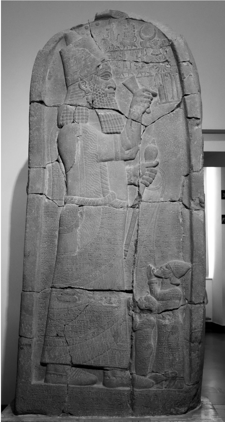
Stela of Esarhaddon from Zincirli-Sam'al. Pergamon Museum Dosseman, CC BY-SA 4.0 via Wikimedia Commons.