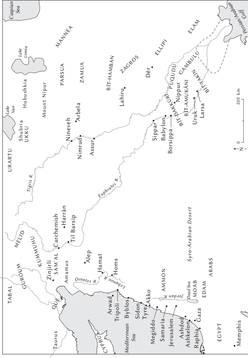
The Assyrian Empire ca. 699 BCE.