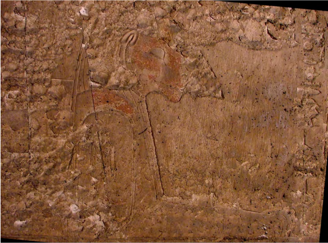
Scene 5 (Aker Group 3). Top: right half, tomb of Pedamenopet (TT 33). Bottom: left half, tomb of Padineith (TT 197).